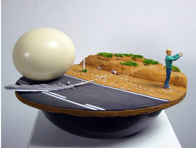
Image credit: Colin Suggett, Selfie , 2016. Mixed media sculpture. Latrobe Regional Gallery Education Collection.