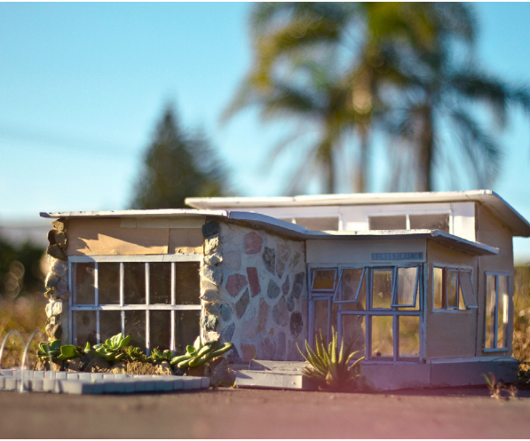
Image Credit: Anna Carey, Sunset Place (Detail) , 2012. Pigment inkjet print, drymounted on dibond, edition 5 of 5, 102 x 151 cm. Latrobe Regional Gallery Collection.

Create your own artwork that incorporates road signs: