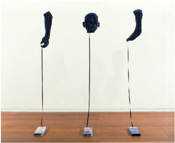
Image Credit: Fiona Hall, All at Sea , 1998, video tape, plastic, wire, nylon and paper, 150 x 200 cm variable size. Latrobe Regional Gallery Collection.

View Fiona Hall's artwork All At Sea . How do you think she created this work?