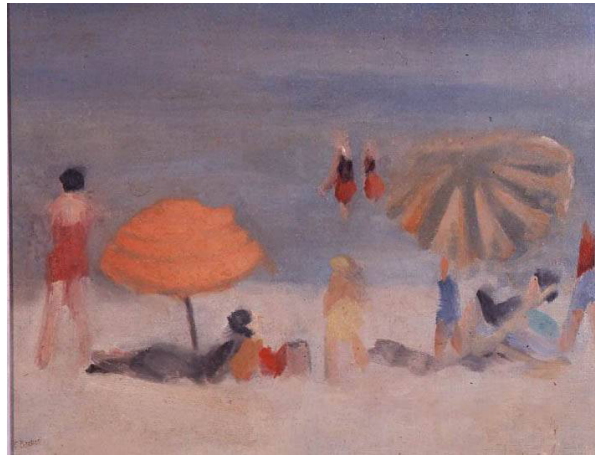
Image Credit: Clarice Beckett, Beach Scene , Circa 1932. Oil on Canvas. Cbus collection of Australian Art

Create a birds eye map of a place you like to visit: