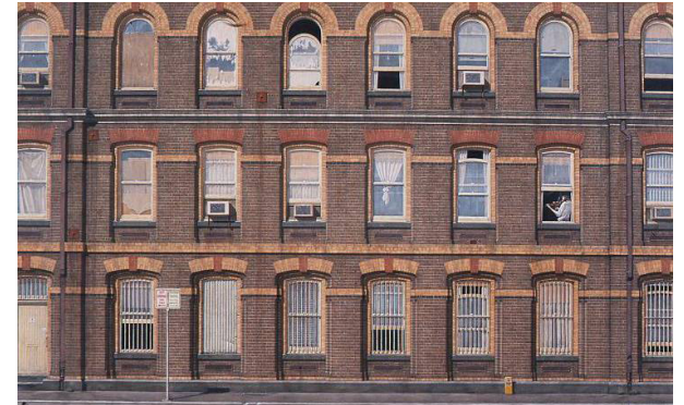
Image Credit: Robert Clinch, 24 Variations on a Theme by Paganini , 1991. Gouache, watercolour and dry brush on paper. Cbus collection of Australian art

View Robert Clinch's artwork 24 Variations on a Theme by Paganini . What type of building is this?