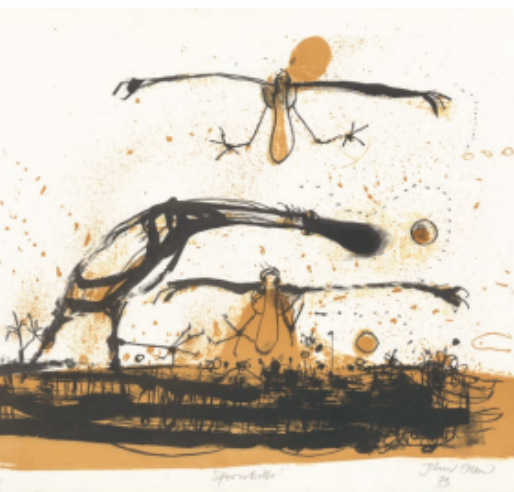
IMAGE: John Olsen, Spoonbills , 1973, lithograph print on paper, edition 1/25, 57.1 x 75.8 cm, LRG Collection (detail)

There are also exciting projects to explore beyond the gallery space, as LRG seeks to activate the gallery in new and different ways. Read on to learn more about what your next visit to the gallery might entail!